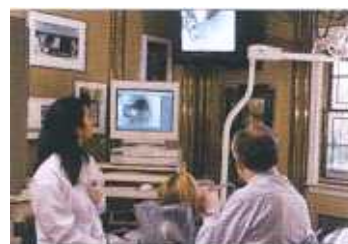
Figure 1—It is important for the patient to be able to see exactly what you and your assistant see, in order to become a codiagnostician.

Perhaps the most important use of the intraoral camera is for the transillumination of the tooth as it records fracture lines. 7 Microcracks, or fracture lines, are easily seen by varying the light intensity and the angle at which the camera captures the tooth surface. A simple occlusal amalgam with the microcrack emitting light through the marginal ridge can be a possible beginning of future tooth loss—particularly if the patient bites on a hard object exactly in the weak point of the fractured area.